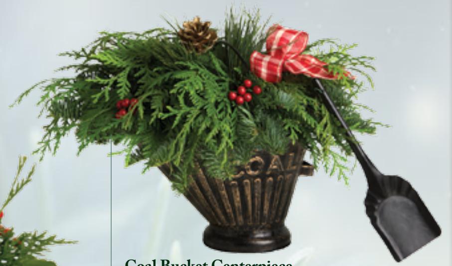
Coal Bucket Centerpiece

D179 Enjoy this replica of a vintage bronze coal bucket and black shovel. It's overflowing with a bountiful array of Noble Fir and Western Red Cedar. Complementing this delightful arrangement are red berries, a gold pine cone and plaid bow. Approximately 10"W x 16" L x 10" T.